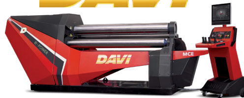
CNC Electric Plate Roll