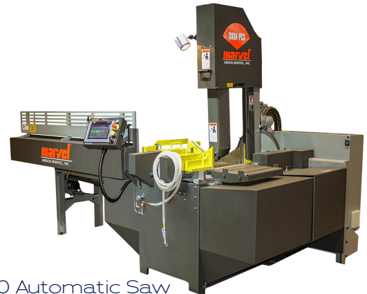
380 Automatic Saw