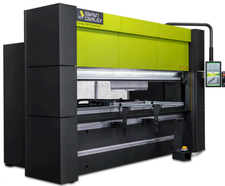
Electric Press Brake

Here's just a sample of some of the equipment we'll showcase!