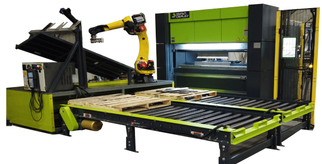
GAD Automated Forming Cell