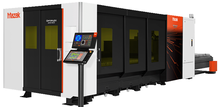
Optiplex 3015 Neo Fiber Laser