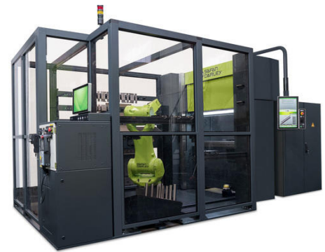
Robotic Mini Cell