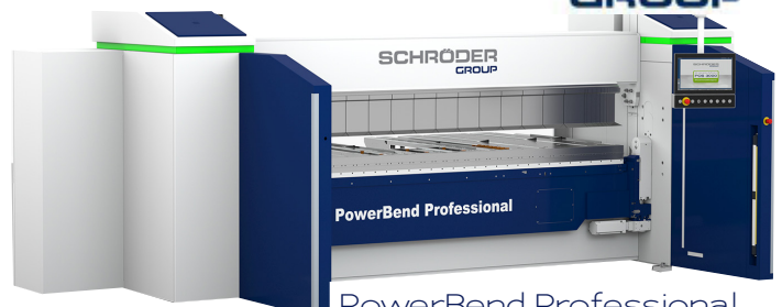
PowerBend Professional CNC Bi-Directional Folding