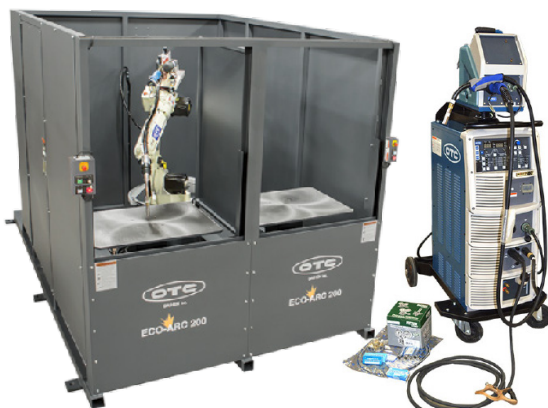
OTC Robotic Welding