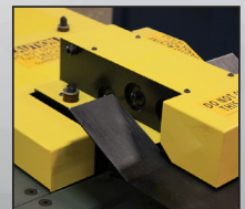
Optional slitter attachment available