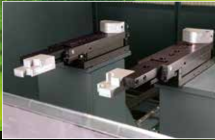
Heavy duty backgauge fingers