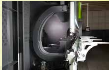
39.37" gap in the side frame