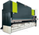
H-Brake HD 500T-1250T