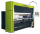
E-Brake 35T-200T E-Brake B 20T-100T