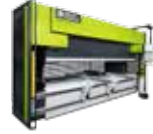
H-Brake Hybrid 110T-170T