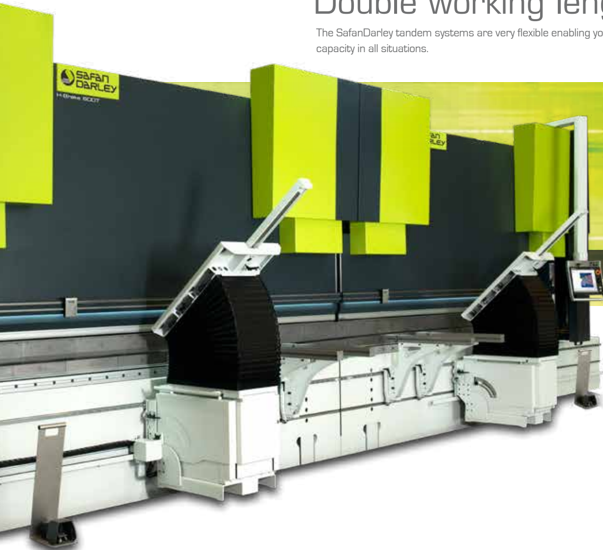
H-Brake HD 1200T 29,53 feet Tandem

The SafanDarley tandem systems are very flexible enabling you to manufacture at optimum capacity in all situations.