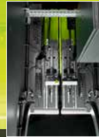
LazerSafe in tandem mode