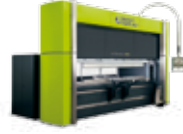
E-Brake 300T Dual Drive