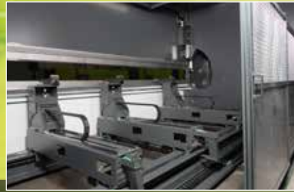
9 axis backgauge