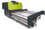
Special cutting lines