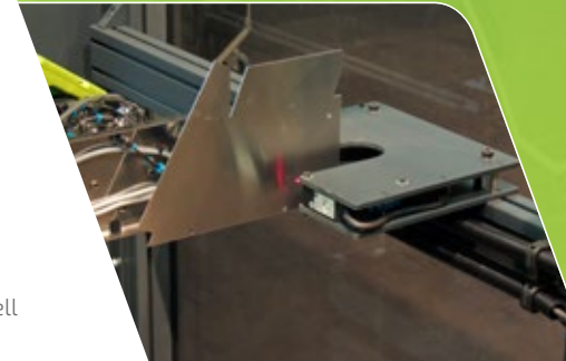
Double-sheet detection and sheet thickness measurement

* CE version: Max. bending speed 23.622 inch/min.