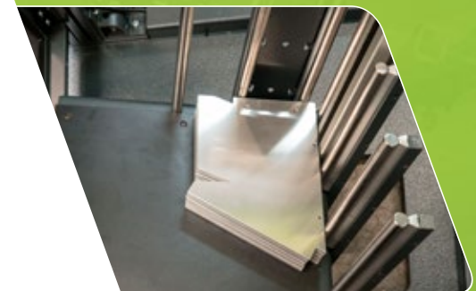
Product Referencing table